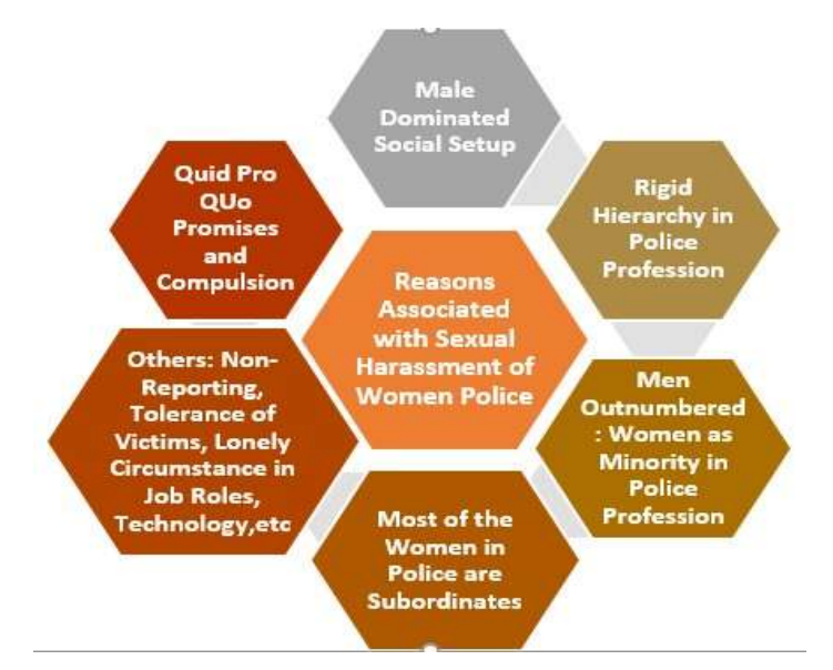
Fig.2: Reasons Associated with Sexual Harassment of Women Police